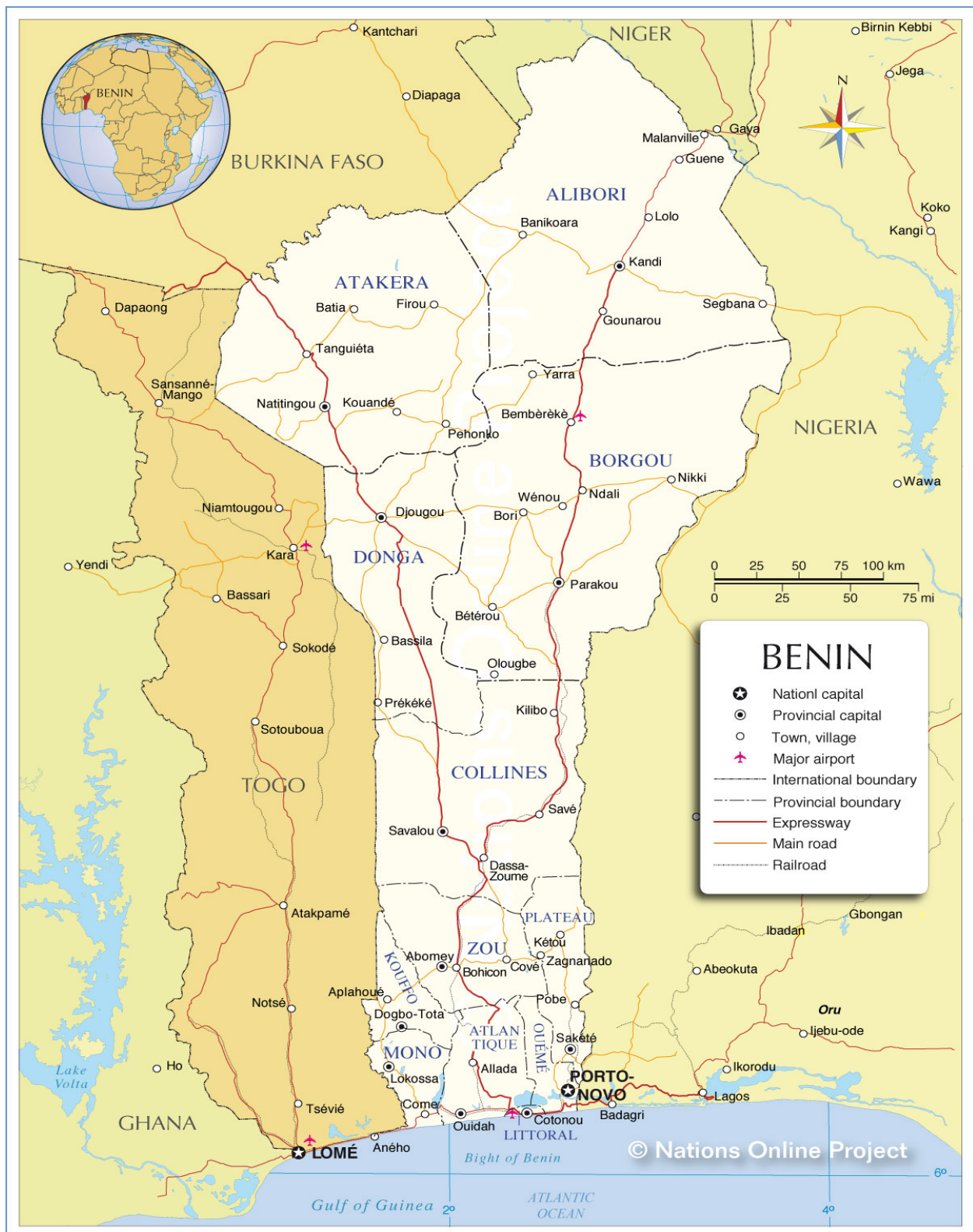
Figure 1. Map of Benin